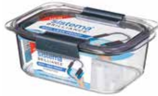
Sistema Brilliance 2L Large Rectangle Container