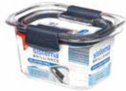
Sistema Brilliance 920ml Medium Rectangle Container